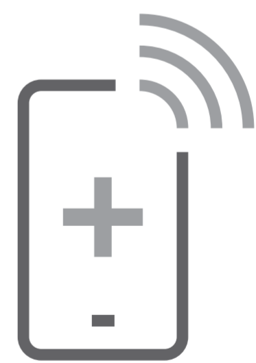
If you need medical assistance, call first. Do not show up without an appointment

For further information, read our pamphlet on the website sst.dk/covid-turist