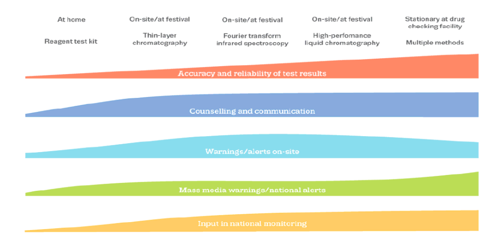
Fig. 2. General value of drug checking methods

General utility of current types of drug-testing methods used